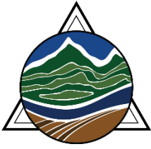
Big Sky GeoCon